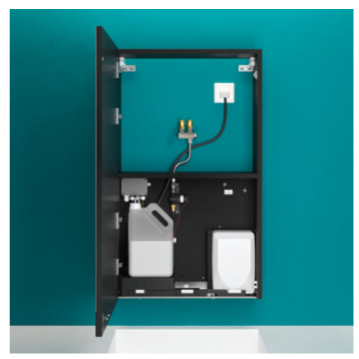
Quick and easy to install: one single electrical supply for all the elements

Images available on our website delabie.com, in the PRESS section